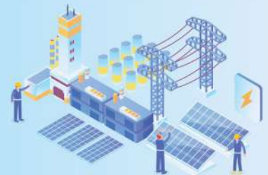
Solar & Electrical Investigation