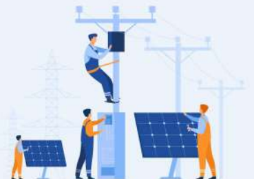
Solar Plant Maintenance